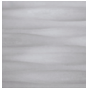
Formglas FRP Finish: Sky Grey - Paint Ready Surface: Wave Sample Size: 4" x 5" Sample Code: 98130