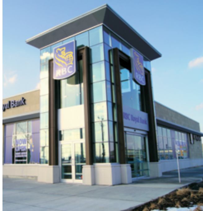
CORNICES & PORTAL ENTRY

To view photos of Formglas FRP applications, or to contact a local Formglas representative, visit www.formglas.com .