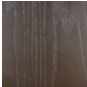
Formglas FRP Finish: Dark Brown Surface: Oak Grain Sample Size: 3" x 3" Sample Code: 98123