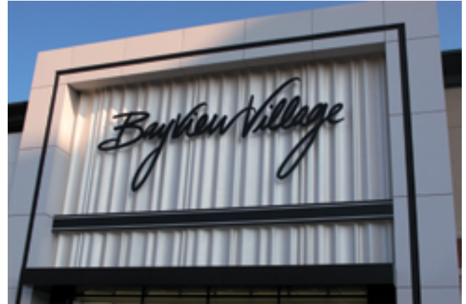
PRE-FINISHED CORRUGATED SIGN BACKER

Formglas Products Ltd. 2 Champagne Drive, Suite 200 Toronto, Ontario, Canada M3J 2C5 T: 1.866.635.8030 F: 416.635.6588 Web: formglas.com Email: info@formglas.com