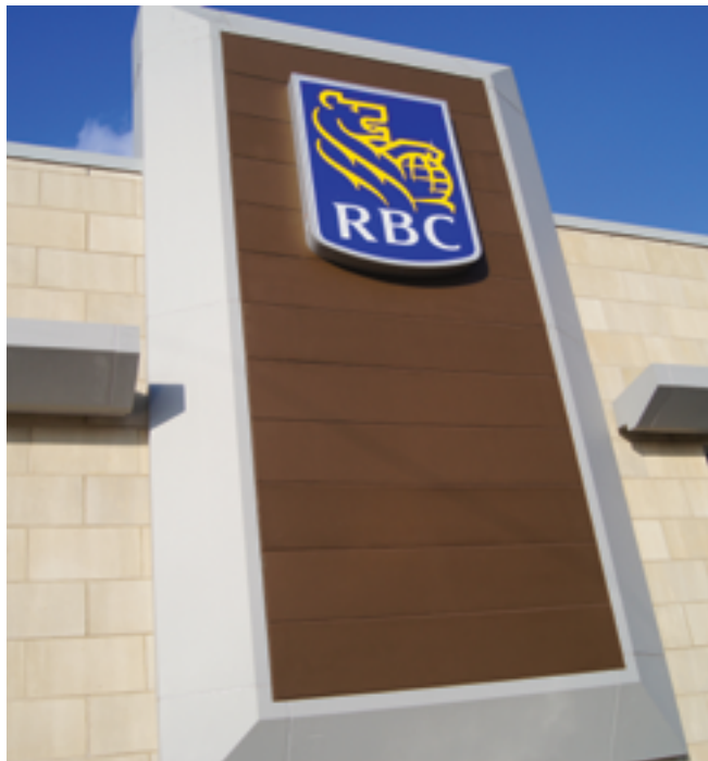
WOOD GRAIN SLATS, PROFILED SIGN FRAME